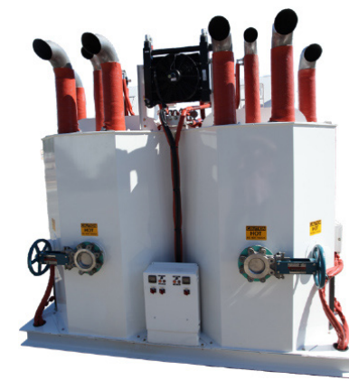
Pre Melter Skid