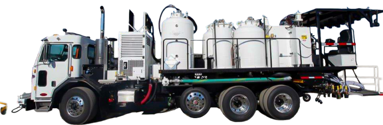
Plural Component Strippers