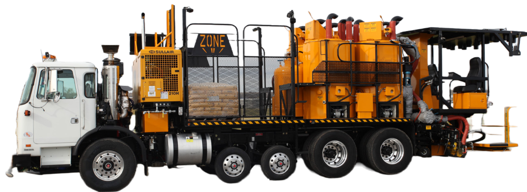
4 Kettle Thermoplastic Stripper