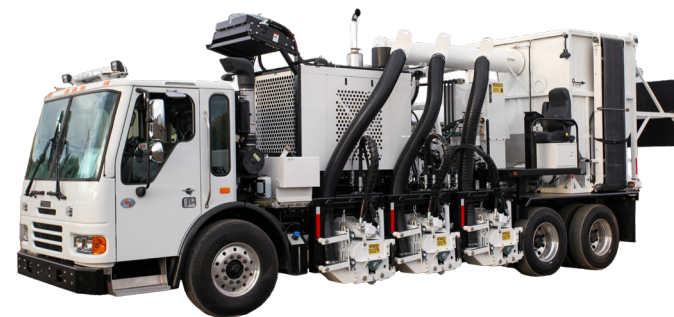
6 Box Grinder