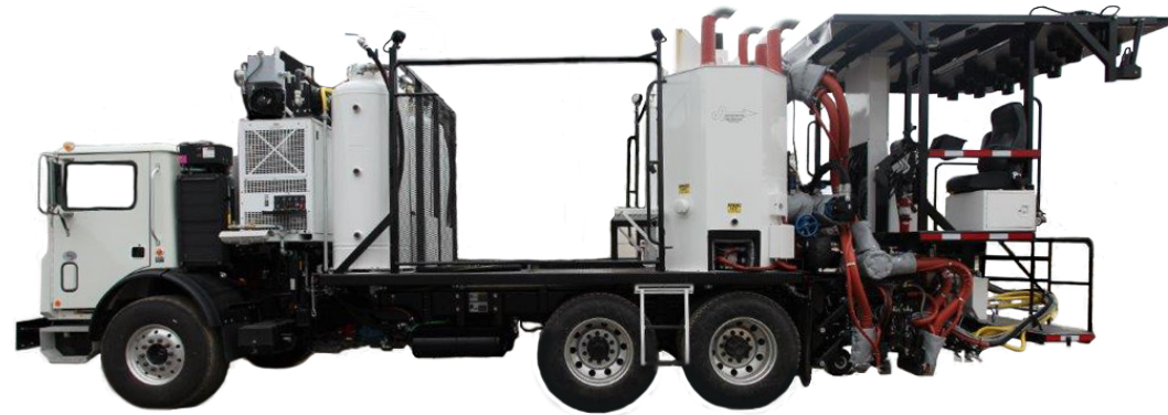
2 Kettle Thermoplastic Stripper

Road-tested strippers for durable heat-applied high-build markings that withstand high speeds and abrasive traffic use.