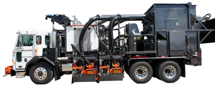
4 Box Grinder