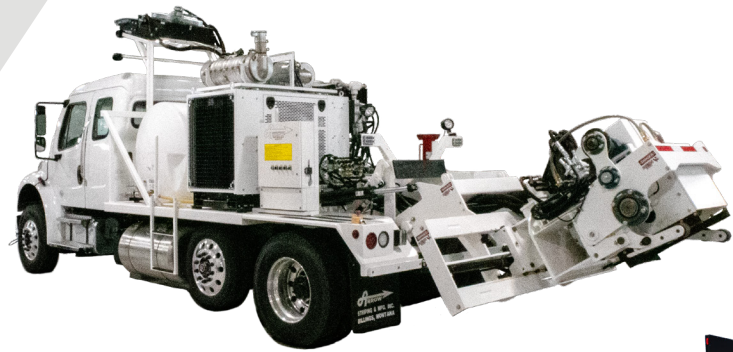
Rumble Strip Truck

Rugged surface prep and removal equipment for grinding, diamond blade sawing and pavement marking grooving with superior depth control and built contractor tough.