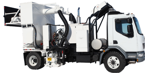
2 Box Grinder